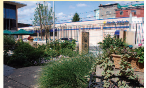
PEP Courtyard Garden

P EP has maintained a long tradition of entering this annual contest and has finished in award categories 5 times in the past seven years. The horticulture program at PEP provides our consumers a great sense of accomplishment and pride preparing beds in the spring and nurturing seedlings to full grown plants through the growing season. They understand the need to feed, routinely water, care for the plants, and plan schedules for clean up and maintenance of the flower beds. PEP consumers and staff enjoy the benefits of relaxing in the lovely environment of our garden across three seasons. The garden is considered a neighborhood gem and our consumers and staff are very proud of it with good reason.