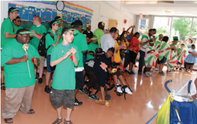
Camp PEP Open House

PEP is grateful for the collaboration shown by the School District of Philadelphia for allowing us to run Camp PEP at the Greenfield School at 22nd and Chestnut Street.