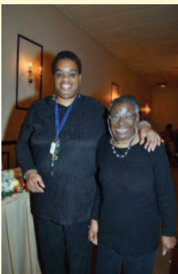
A Holiday Gathering, PEP auxiliary holiday party